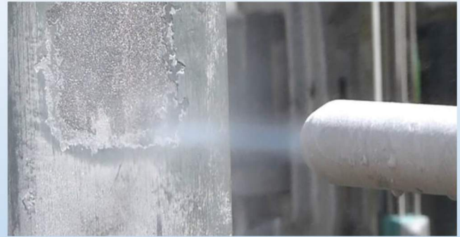
The Three Powerful Forces of HiCO2 Blasting