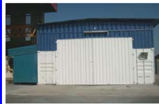
YOHO Development Project EPC2 Production - PFP Works