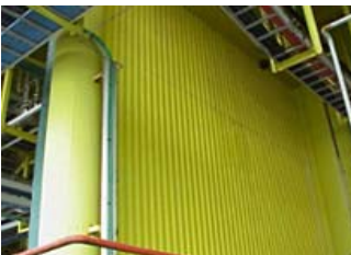
E11 P-B Topsides - Passive Fire Protection Works And Supply of Blastwall

5-Acre Fabrication Facilities in Pasir Gudang consists of Covered Fabrication Workshop, Blasting Chamber and Blasting & Painting Equipment & Facilities, under one roof.